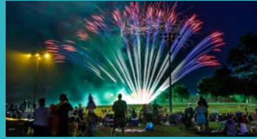
#1 Family Night 13%