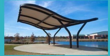
#1 Shade Pavilion 14%