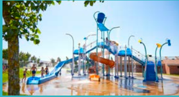
#1 Water Playland 26%