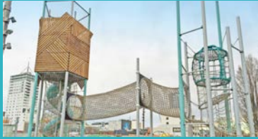
#1 Rope Canopy 19%