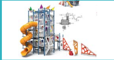
#2 Super Tower Slide 16%