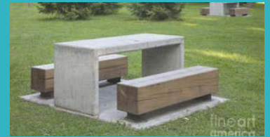
#2 Benches & Tables 13%