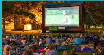
#2 Movies & Stars 12%